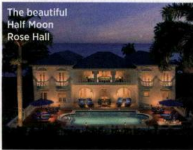
The beautiful Half Moon Rose Hall

Cliff-jumping at Rick's Cafe. Plunge into the Caribbean from some